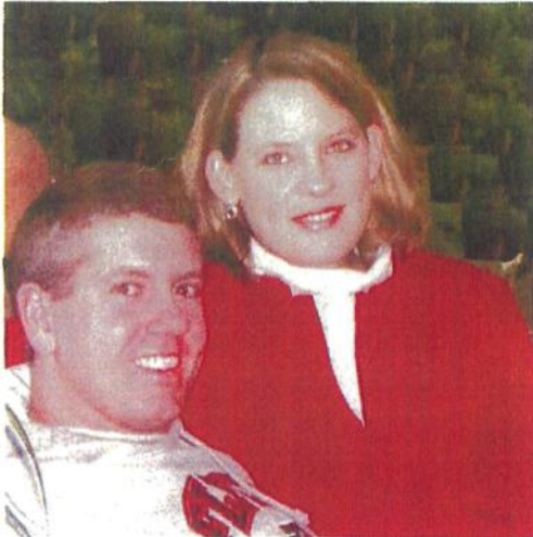
Marriage Encounter is for couples with good marriages who want to make them better.

Rest assured, your discussions as a couple will stay between the two of you, taking place in the privacy of your own room. At no point will you be required to share in a group setting.